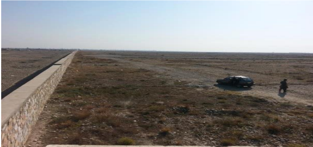
Figure: Land inside HIP identified for the installation of solar Plant

The site is located on Jalalabad-Torkham Highway and it is well connected by roads on the outside and inside of the park. Internal electric distribution network has been constructed however; it is not connected with the city grid yet . Electricity power Supply (two sets of Diesel Generators of 250kW) for site development work also exists in the area.