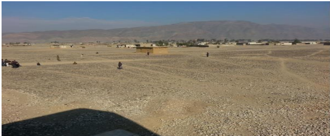
Figure: Land outside HIP identified for the installation of Solar Plant